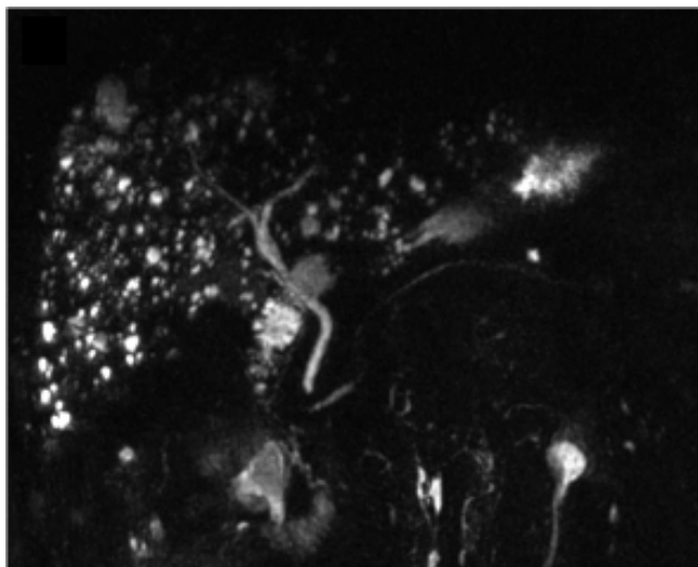
Figure 3. MRCP shows no communication of the lesions with the biliary duct.